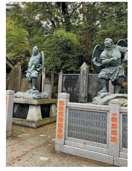
The tengu statues of Yakuo-in Temple

"Have you seen the tengu statue on Mt. Takao?" (A tengu is a longnosed goblin.) When we asked a foreign visitor, she didn't understand what a tengu was, so we would like to explain it in detail.