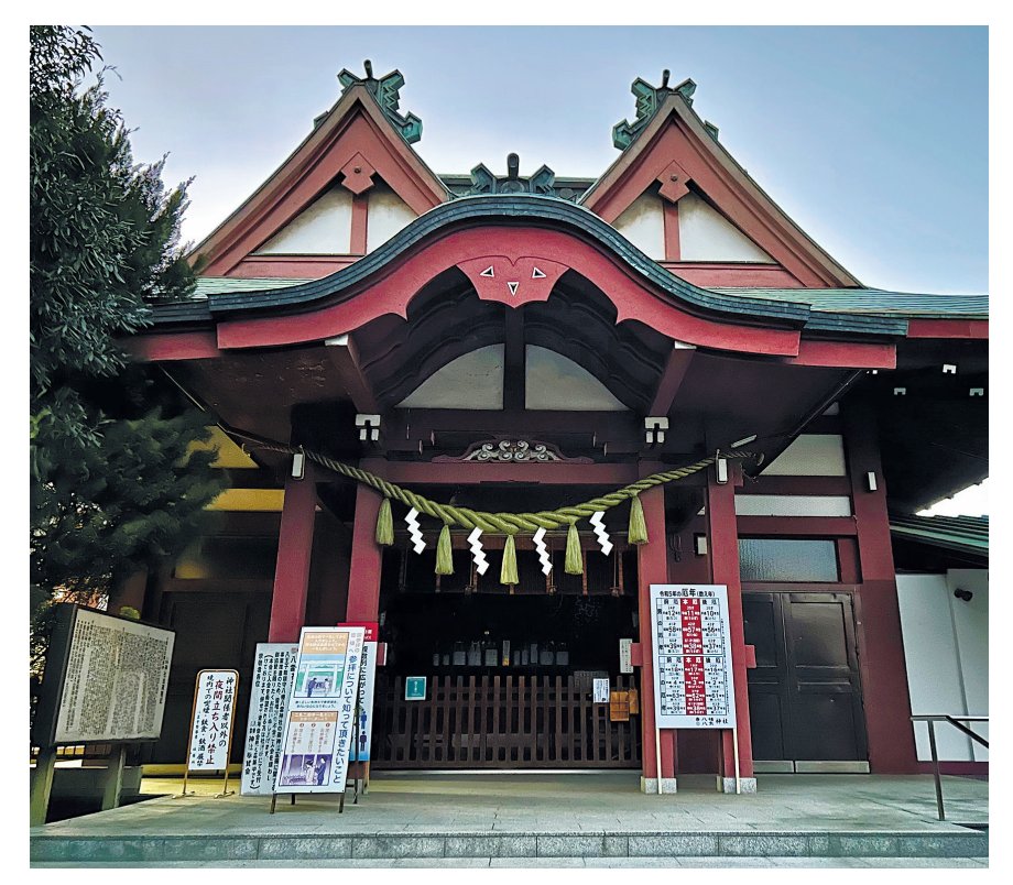
Hachiman Yakumo Shrine built in Yokoyama-cho

Shrine has always been at the center of Hachioji's long history and has long been carefully protected as a shrine dedicated to the God of Hachioji. Japanese shrines are an object of faith for the people of that area, both now and in the past. People visit and pray for peace in their daily lives. The Hachiman Yakumo Shrine has watched over the development of Hachioji, survived the war era, and continues to be the shrine closely associated with Hachioji. Everyone, please check out the history of the shrine related to your hometown and visit it. You can learn and discover the history of your hometown.