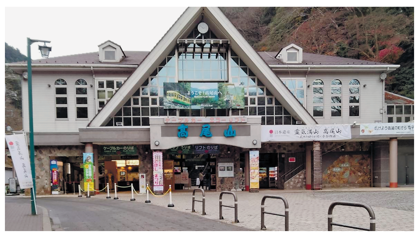
Kiyotaki Station, a cable car station at the foot of Mt. Takao

We came to see the view from the top of the mountain. (Kaito and Brick)