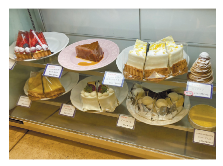
Seasonal menus without additives

A special feature of the shop is the concerts. Musicians are invited to give the customers a feeling of luxury.