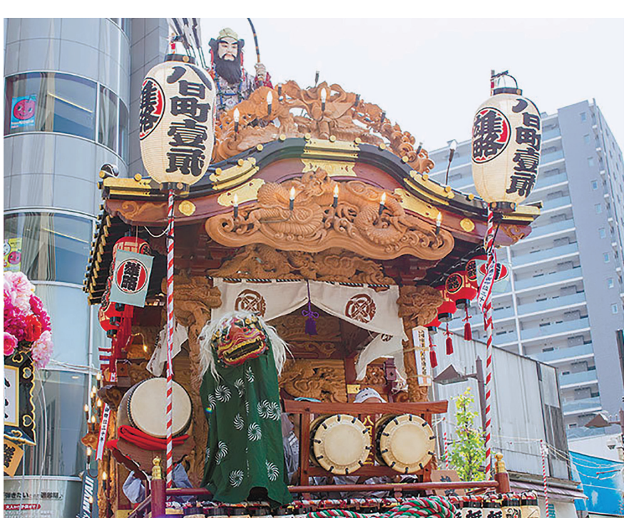
The float during the Hachioji Festival