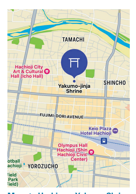
Maps to Hachiman Yakumo Shrine from Hachioji station